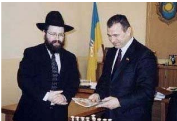
Ukraine - Prime Minister Viktor Yanukovich